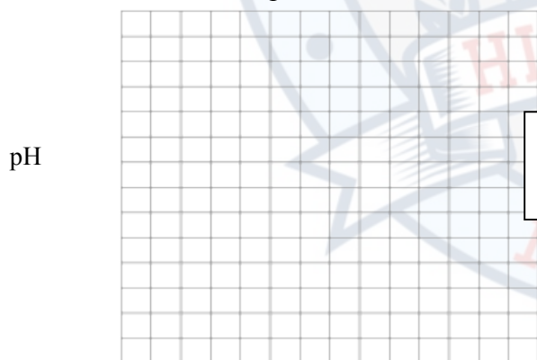
The Effect of the Number of Drops of HCl on the pH of Water and Potato